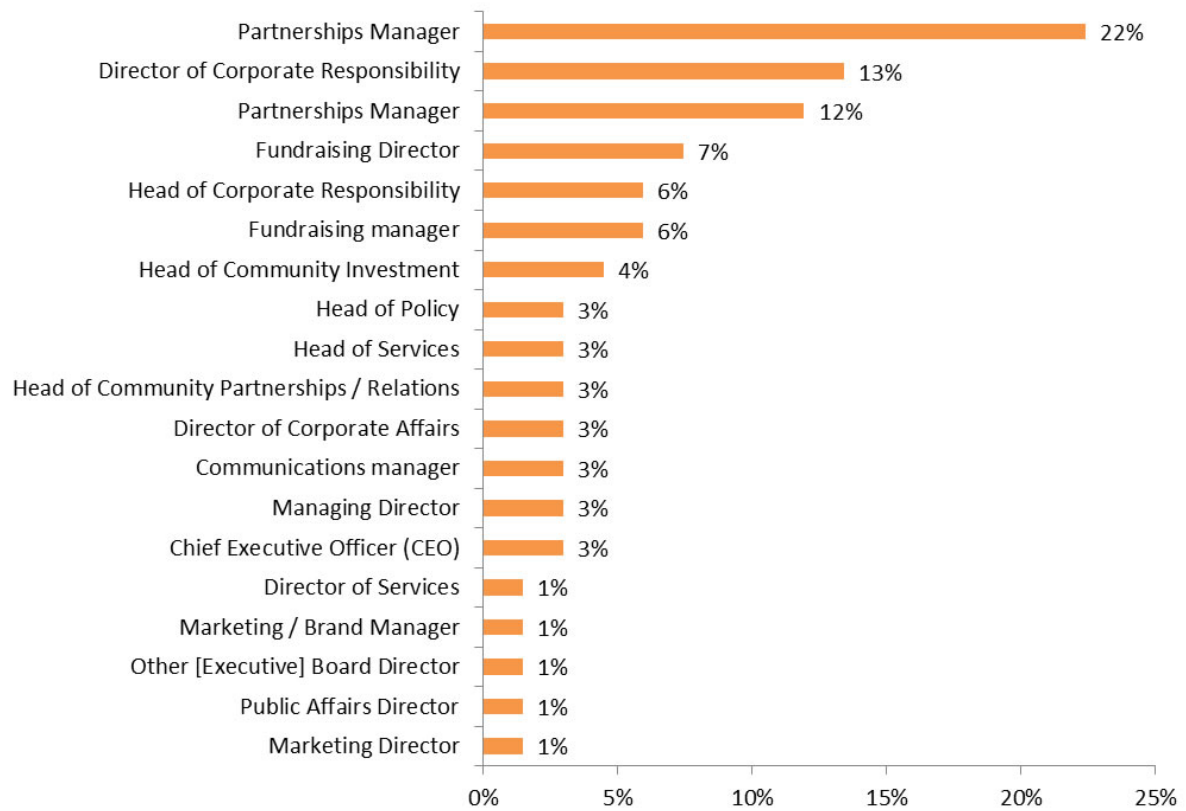
Figure 28: Respondents' roles